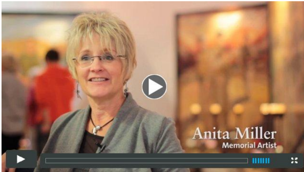
The Lima Company Memorial: The Eyes of Freedom