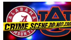
Mobile Police: Man Shot in Argument Over Alabama, Auburn Rivalry-WKRG

As I watched the bowl games this past couple of weeks I was struck by a new series of ads being run by Chick-fil-A. They feature staged "real life" scenarios which are used to test whether fans of opposing teams would come to the aid of their rivals.