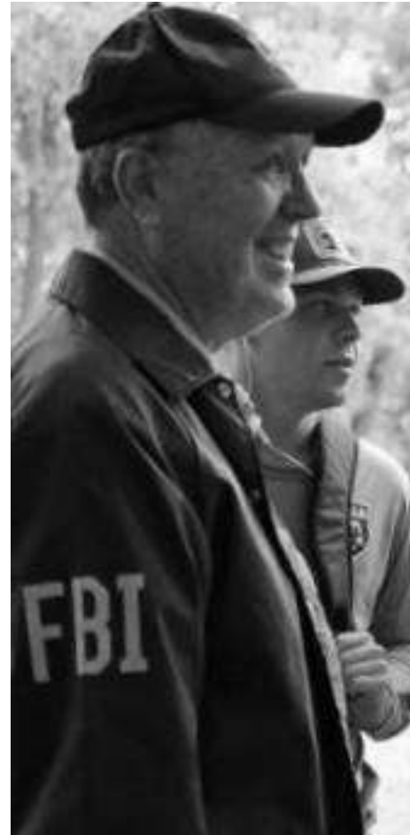
Fifty years later he was still actively involved with Criminal Justice and the Law Enforcement community, pictured here with Huntingdon College students, where he had started their Criminal Justice program, after doing the same at Faulkner University, where he worked for more than 15 years after retiring from the FBI in Montgomery and Selma.