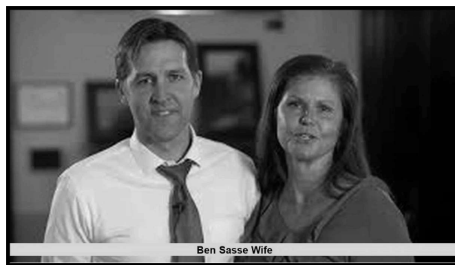
Ben Sasse Wife